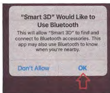
Bluetooth permission on first launch: User must select OK